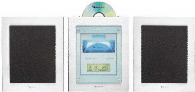
Up to 3 discs can be conveniently loaded without the use of trays or magazines.

The main unit houses a MusicBank™ 3-disc CD changer, FM/AM tuner and preamplifier. Function control buttons are arranged conveniently on the top panel. A front window allows you to see the operation of the changer, which can be illuminated subtly in blue or amber (user selectable).