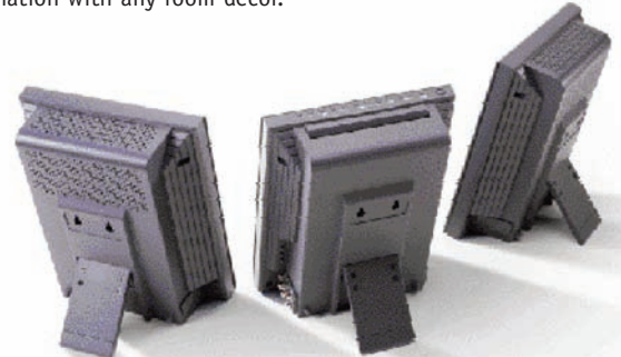
Easel-styled supports allow SoundSpace 5 to be angled when free standing. Keyholes are provided on each unit for wall mounting.

The remarkable SoundSpace 5 system delivers stereo reproduction that rivals the concert-hall quality of full-sized Nakamichi components. Its three units, styled in contemporary brushed metal and acrylic, are designed to be arranged in a variety of ways – standing, tilted like easel frames, or even hung on the wall. Charcoal, blue or green speaker grilles are included for coordination with any room decor.