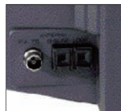
75 and 300 ohm antenna connections