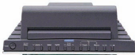
All control functions and disc loading slot are located on top of the main unit.

The main wireless remote control unit engages all the functions of the SoundSpace 5, including disc eject. The secondary remote unit controls major functions and allows blind key operation.