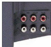
Analog inputs and outputs plus an optical digital output provide interface options.