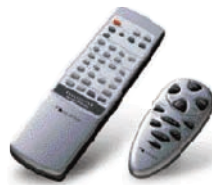
Full-function and simple remote control supplied

The inventive minds of Nakamichi have combined their legendary abilities in stereophonic reproduction with sensitivity to your need for "getaway" personal space. The result is SoundSpace 5, a stereo music system designed for personal stereo satisfaction in places where full-sized audio components are not appropriate.